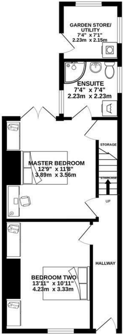
GROUND FLOOR 474 sq.ft. (44.1 sq.m.) approx.